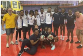
Island Academy won the male and female titles on Monday