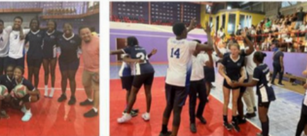
The celebrations were ongoing at YMCA after both teams won the finals

The celebrations were in full swing for Island Academy on Monday afternoon as they claimed double championships in both the male and female divisions of this year's inter-school Volleyball League. Island Academy's female team started the celebrations first, defeating Antigua Girls' High School (AGHS) 2-1 in sets at the YMCA Sports Complex. The former champions AGHS drew first blood taking the first set 15-13, but with a plethora of unforced turnovers, the all-girls school quickly found themselves in deep water as they lost the second set 11-15. It was a seesaw battle in the third and deciding set but once again turnovers would plague AGHS, giving Island Academy the momentum to steal the set and virtually the